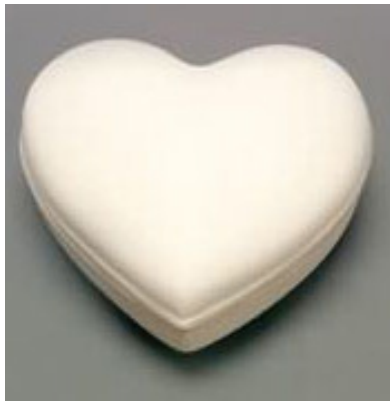
Heart Box CCX015