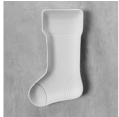
Stocking Dish DB38570