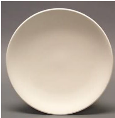
Coupe Dinner Plate CCX151